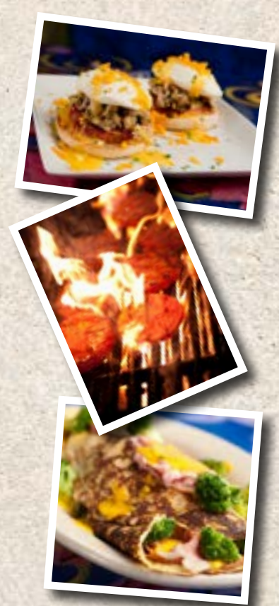
Includes Beverage (Soda, Coffee, or Tea)