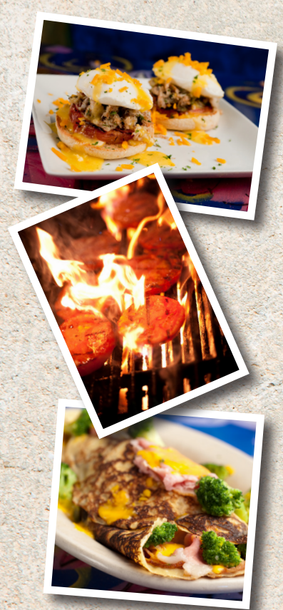
Includes Beverage (Soda, Coffee, or Tea)