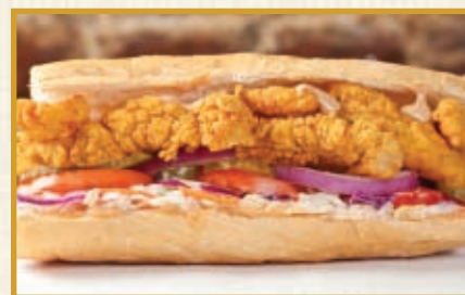
FRIED CATFISH PO-BOY

Our succulent beef patty seasoned and hickory wood grilled, topped with Cheddar cheese. Served on your choice of bun or French bread.