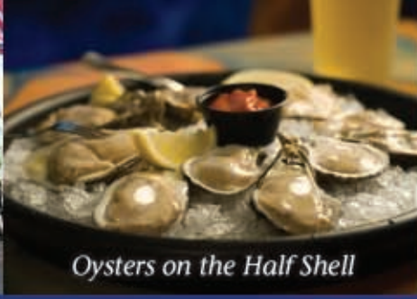
Oysters on the Half Shell