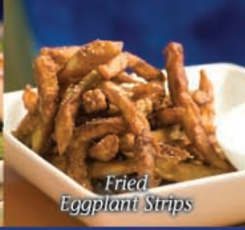
Fried Eggplant Strips