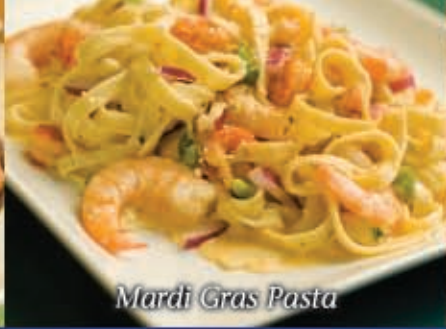
Mardi Gras Pasta