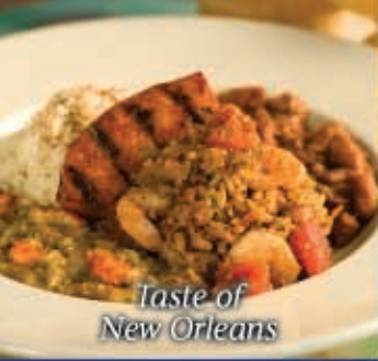
Taste of New Orleans