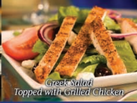
Greek Salad Topped with Grilled Chicken