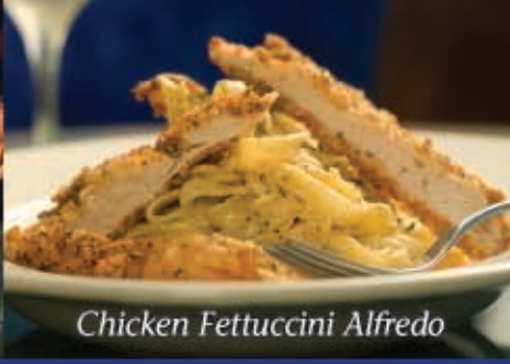
Chicken Fettuccini Alfredo