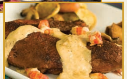
BLACKENED BAYOU DUCK

Please notify us of any food allergies. no separate checks please. Ask our staff about gift certificates and hosting your next party or event. 18% gratuity is added for 5 or more people. We deliver in the French Quarter.