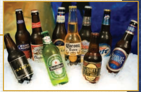
SELECTION OF BEERS