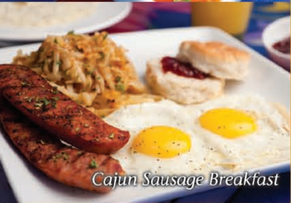
Cajun Sausage Breakfast