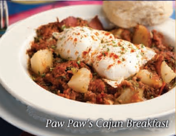
Paw Paw's Cajun Breakfast