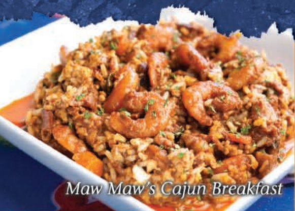
Maw Maw's Cajun Breakfast