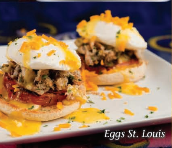
Eggs St. Louis